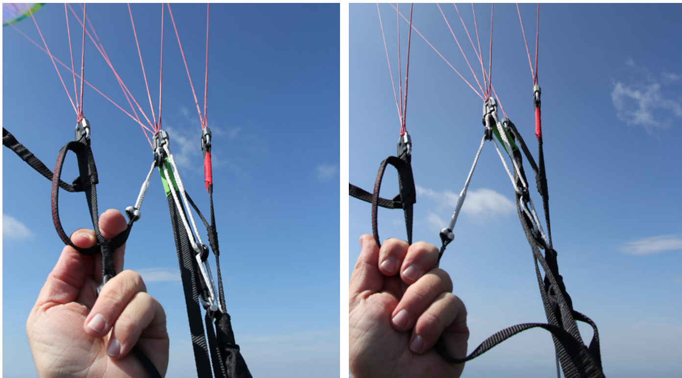
FIG. 1: To use the C-steering system, place your fingers either side of the C-riser and grasp the C-handle. Applied pressure acts on the C- and B-risers in a 3:1 ratio.